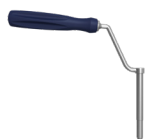
Fixed drill guide