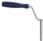
Variable drill guide