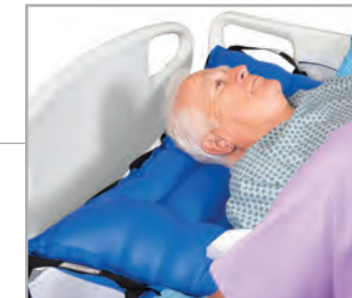
Integrated head support

Helps sustain a 30° side-lying position and reduces pressure by offloading sacrum Minimize manual activity as wedges slide into a turn, reducing the need for a log roll Minimizes patient migration down the bed Reduces the need for boosting, minimizing shear and friction