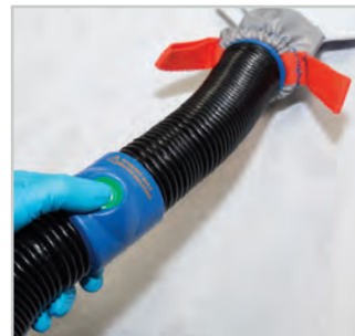
Point of care power switch

Helps protect hose from environmental contamination