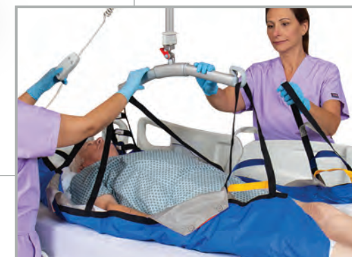
Intuitive strap system