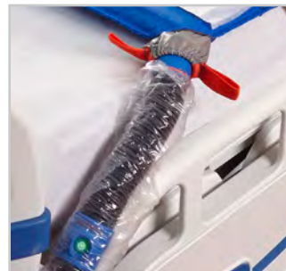
Hose Protection Sleeve

Hi-tech fabric Promotes a healthy microclimate for the skin and is compatible with low air loss technology Easy to clean surface