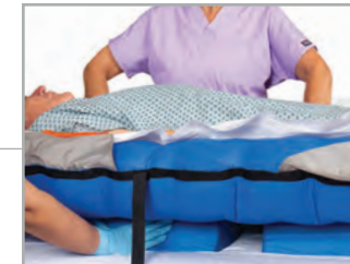
30° Body and Anchor Wedge System

Quick connect valve Provides an easy, secure connection and a quick release