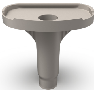
Triathlon Revision Baseplate