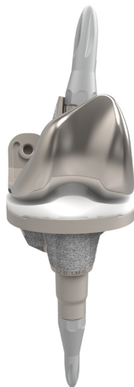
Triathlon TS Femur