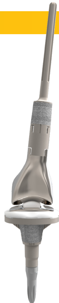
GMRS Distal Femur