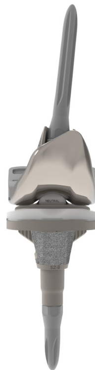
Triathlon Hinge Femur