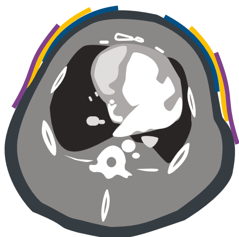
FIGURE 1. Axial view from CT scan of the thorax, with the right ventricle (RV), left ventricle (LV) and left atrium (LA) labeled. Radio-opaque markers were used to identify electrode pad locations.

Three defibrillation therapies representing maximum AED and manual mode doses from two commercially-available defibrillators with biphasic truncated exponential waveform (BTE) were tested at each pad position.