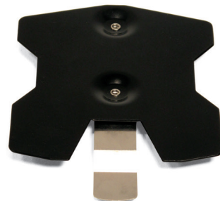
SMRT charger mounting bracket