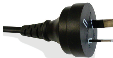
240V AC - Australia (AS-3112 without ground pin)