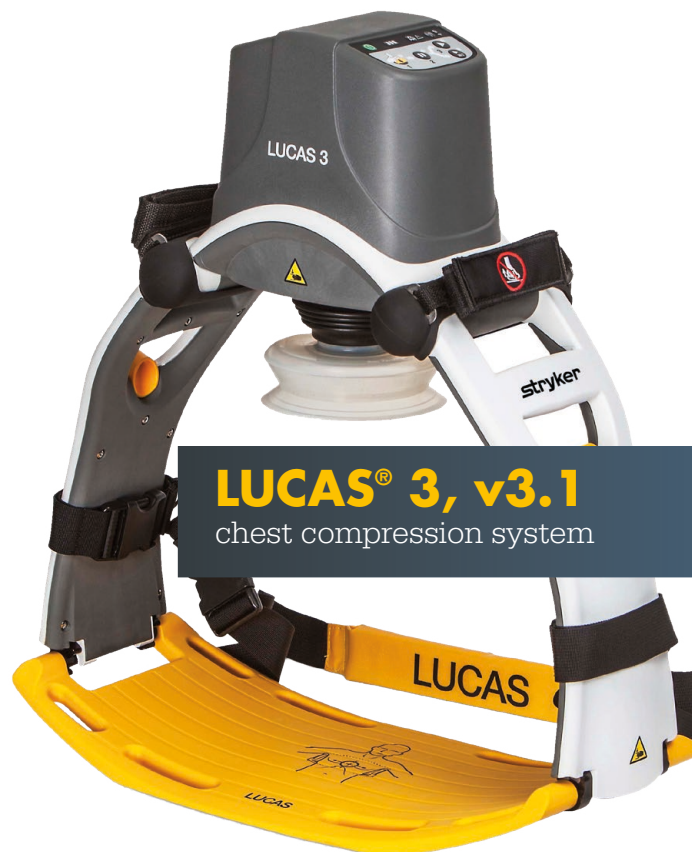
LUCAS® 3, v3.1 chest compression system

When managing suspected and confirmed cases of COVID-19, “The number of individual staff members involved in the resuscitation should be kept to a minimum with no or minimal exchange of staff for the duration of the case, if possible.” 5