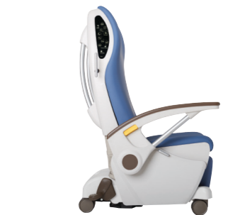
4. Upright one