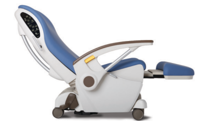
3. Recline position