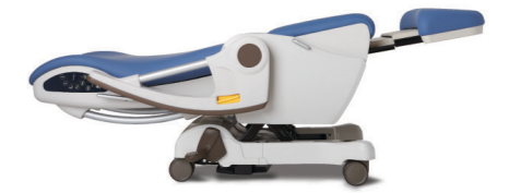
1. Trendelenburg position