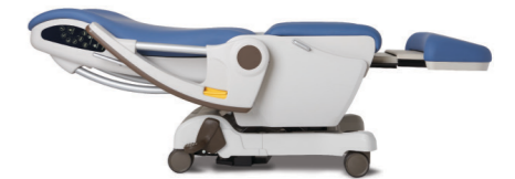
2. Full-flat transfer