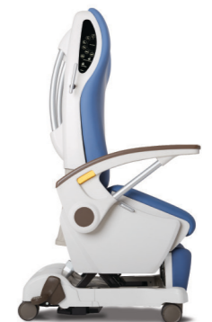
6. Stand Assist