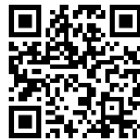
Application User Guide (4.1) PN 700001808669