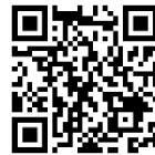
Surgical Guide (4.1) PN 700001808668