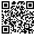
Surgical Guide (4.0) PN 214408